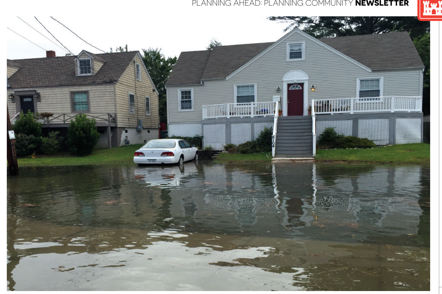
FLOODING IMPACTS IN A NORFOLK NEIGHBORHOOD FROM HURRICANE JOAQUIN ON OCTOBER 5, 2015.

barriers, over five miles of flood walls and levees, pump stations, tide gates, nonstructural measures including elevation and acquisition, and natural and naturebased features including living shorelines and oyster reefs. Those measures will also improve the life safety situation for much of the population of approximately 250,000 residents by reducing risk to both private property and much of the critical infrastructure and evacuation routes in the city.