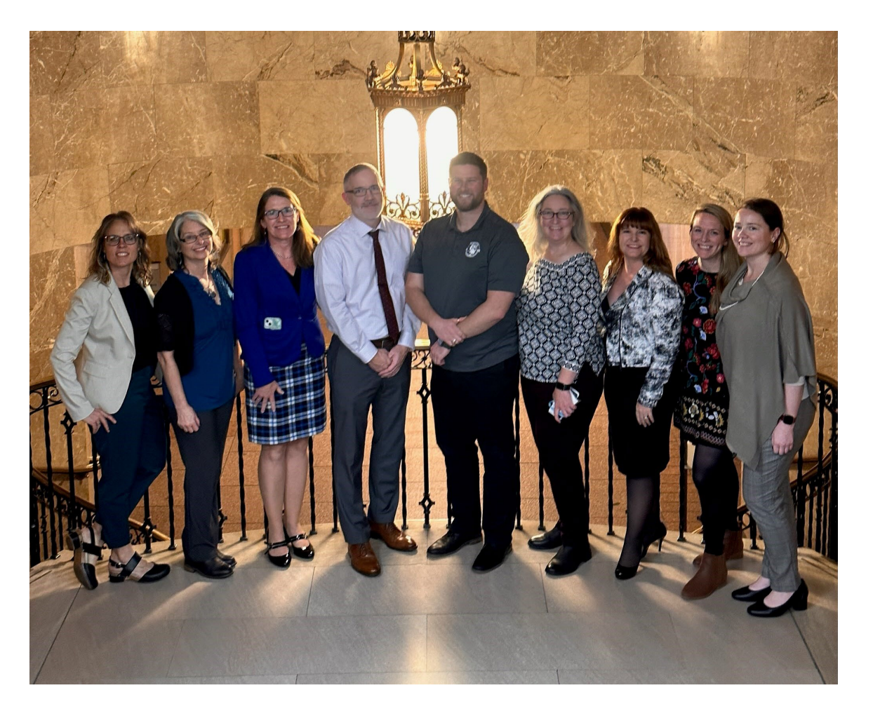
2023 National Planning Community of Practice Workshop