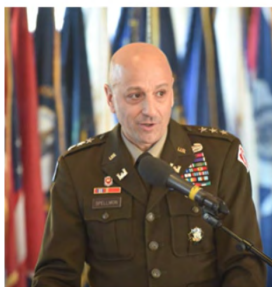
Metropolitan Washington DC, CSRM