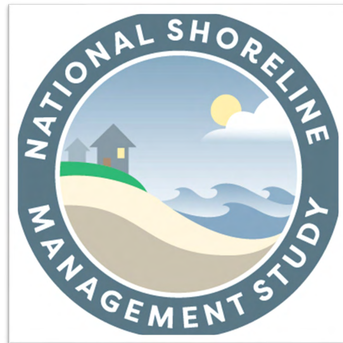
National Shoreline Management Study (NSMS) National Assessment Team (IWR) (Nationwide Support)