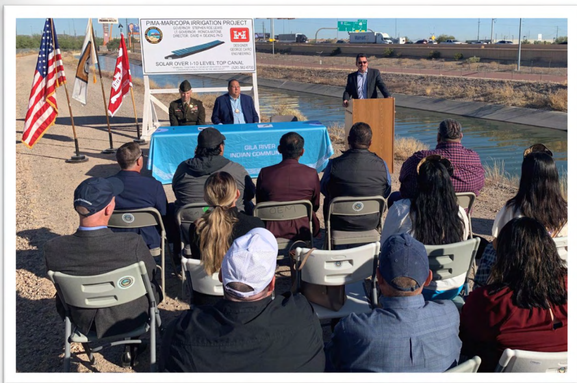
Pima-Maricopa Irrigation Renewable Energy Project, AZ I-10 Solar Over Canal Tribal Partnership Program (TPP) Team (SPL) (Programmatic)