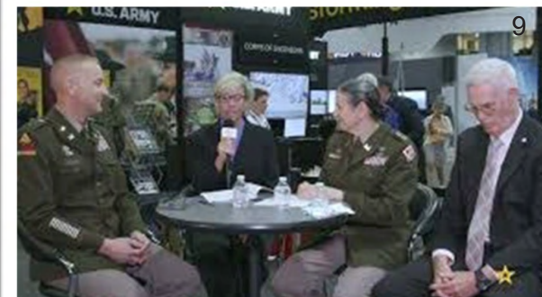
Akutan Harbor Navigational Improvements, TPP