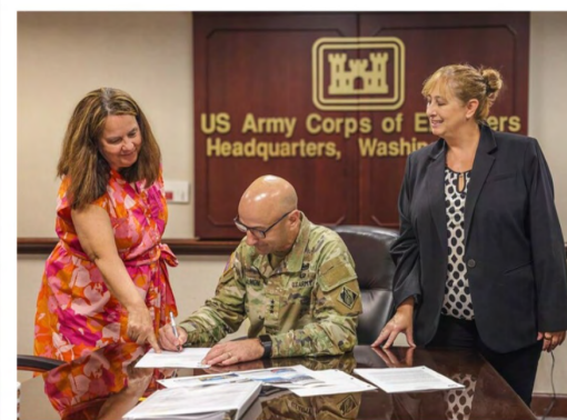
Puerto Rico, CSRM