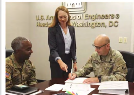
Tar Pamlico River Basin, FMR