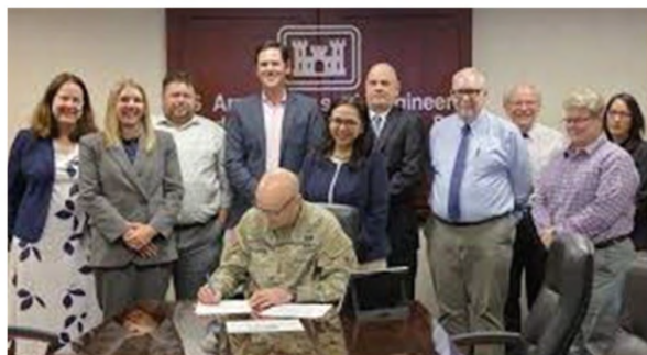
Oakland Harbor, DDN