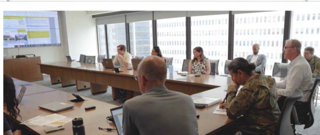
Baltimore Metropolitan, CSRM