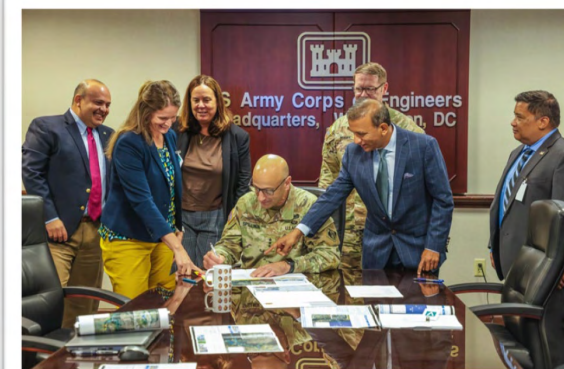
Tampa Harbor, DDN