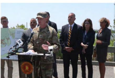
South Shore Staten Island, CSRM