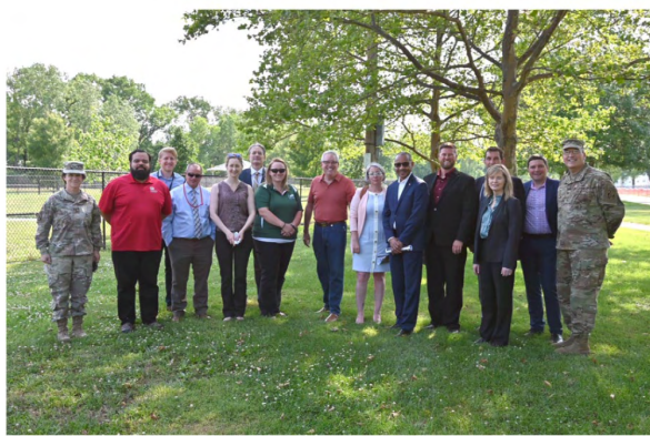
University City Branch, River Des Peres, FRM