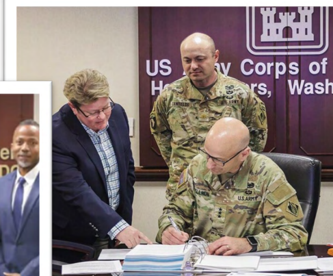
Ponte Verda Beach, CSRM