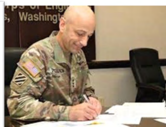
Miami-Dade Back Bay, CSRM