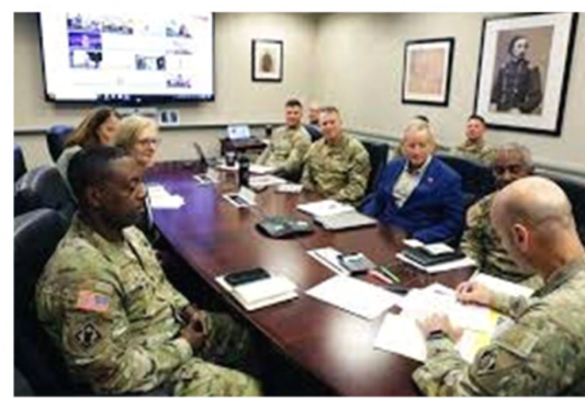
Western Everglades Restoration, AER