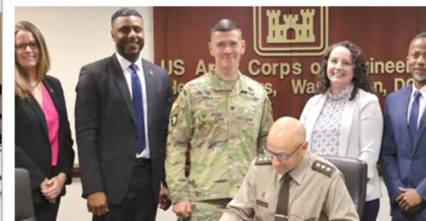
St. Tammany Parish, CSRM