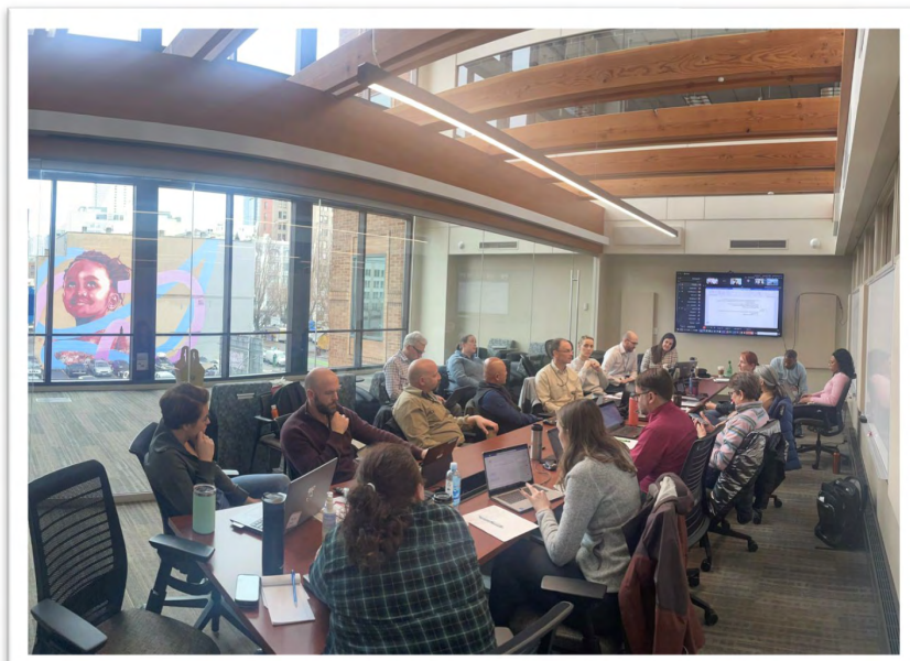
Willamette Valley System (WVS) Disposition Study and Report to Congress team (NWP) (Enterprise)